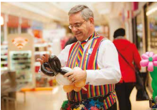
Kids Club activities