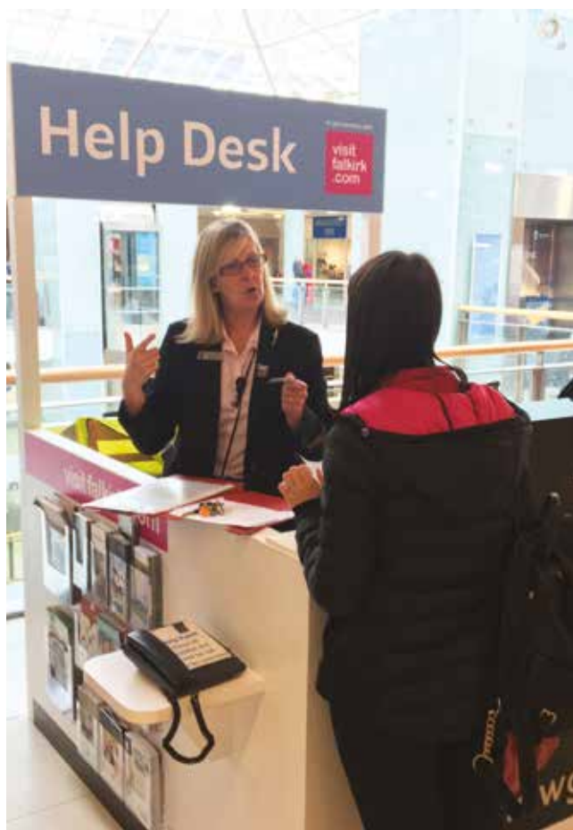
The Howgate Help Desk