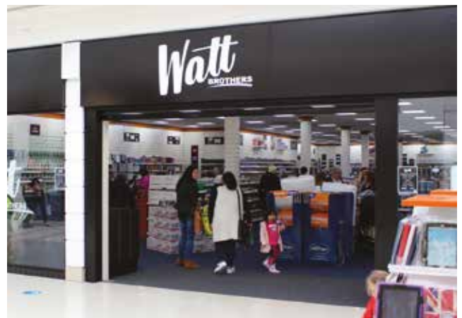
Watt Brothers is opposite Wilko between the High Street entrance and Pleasance entrance.