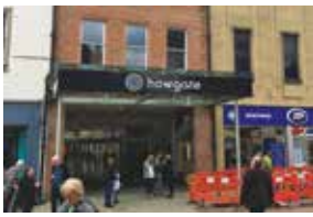
High Street main entrance