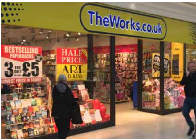
The Works is located in the middle of The Howgate Shopping Centre.

To help you, or the person you are with, navigate around the shops here are some pictures of our shops in the Centre, that you can use as signposts.