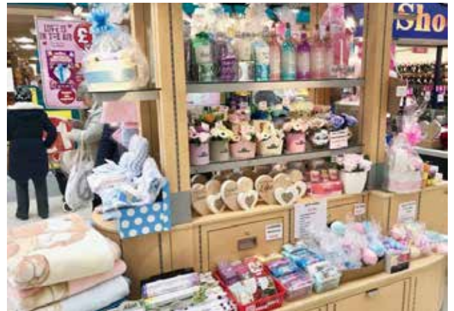
Retail Merchandising units (gifts)