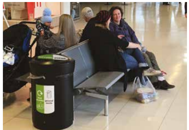
You can eat a packed lunch on one of the benches in The Howgate Shopping Centre. The quietest area to sit on a bench is outside River Island.