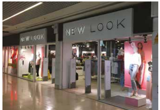
New Look is located next to the food court in The Howgate Shopping Centre.