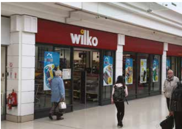
Wilko is towards the main entrance and can be entered from the shopping centre or the High Street.