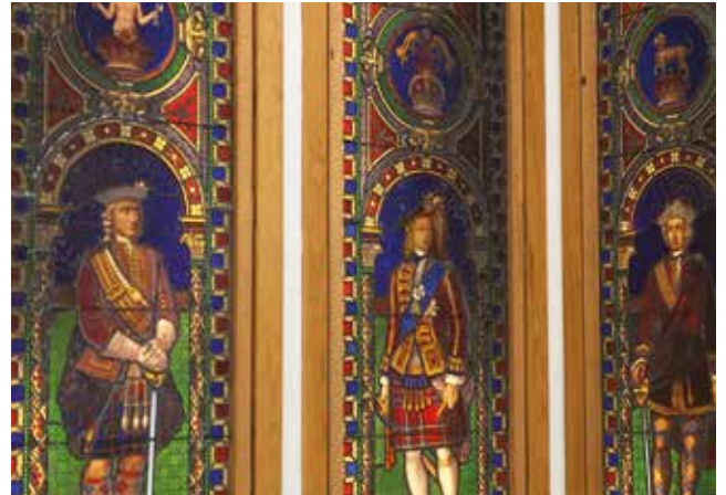
The stained glass window