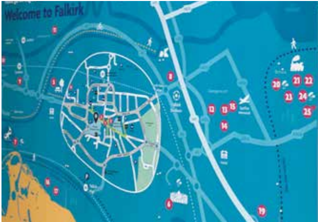
The map of Falkirk