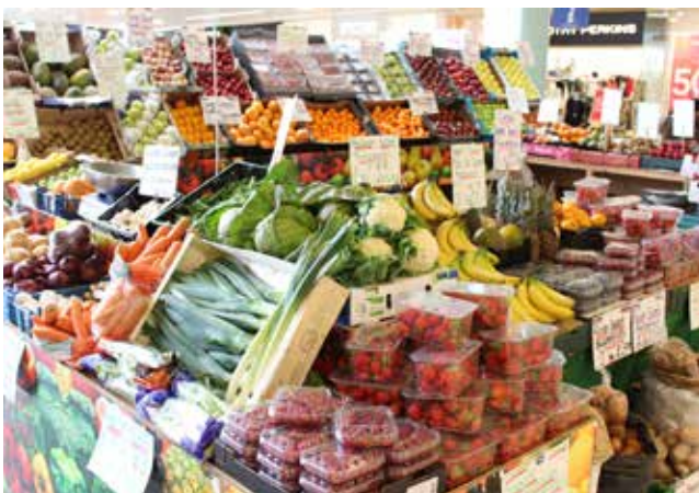
On the mall floor there is also places to buy food to takeaway

The Food Court is one of our busiest and noisiest areas; we have therefore identified a number of quieter eateries and places that you can also sit to eat packed lunches.